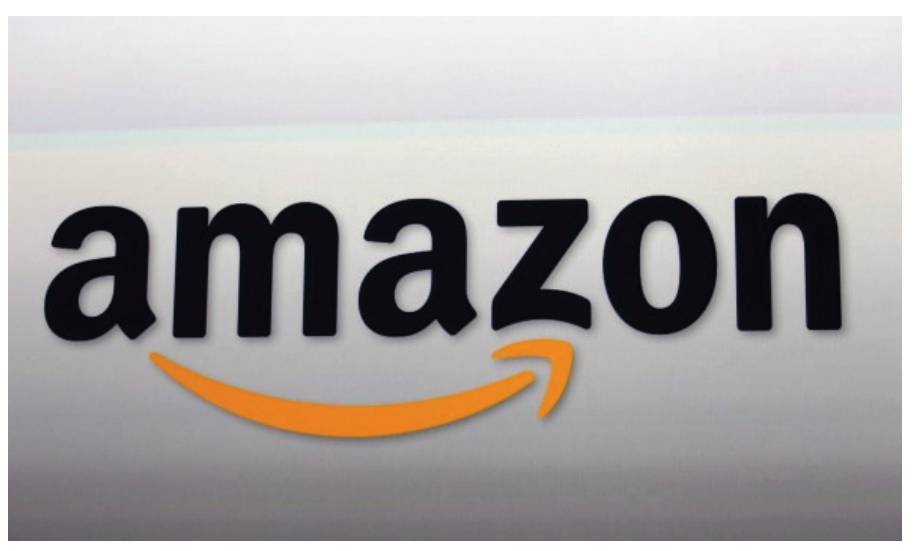
Amazon Web Services declined to discuss whether it would compensate customers who lost business during the outage.

AWS allows clients to use cloud and other computing functions for which they would otherwise need their own servers.