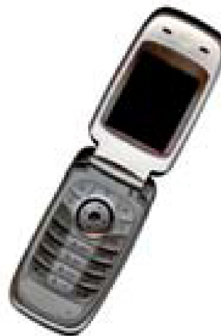
Fig. 2. Example of an unacceptable low-resolution image