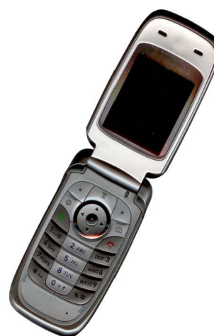
Fig. 3. Example of an image with acceptable resolution