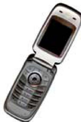
Fig. 2. Example of an unacceptable low-resolution image

Figures must be numbered using Arabic numbers. Figure captions must be in 8 pt Regular font. Captions of a single line (e.g. Fig. 2) must be centered whereas multi-line captions must be justified (e.g. Fig. 1). Captions with figure numbers must be placed after their associated figures, as shown in Fig. 1.